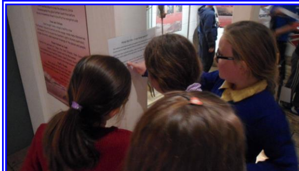
Year 4 enjoying their visit to Stewart Park and the Captain Cook Museum.