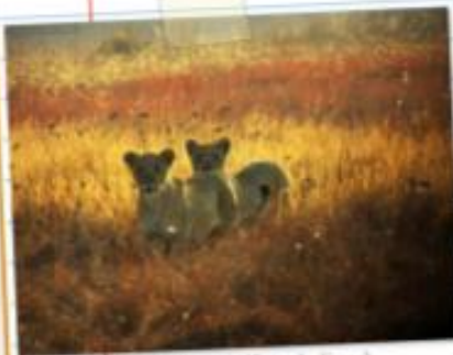
Two lionesses (female lions).

Wild lions currently live in Africa and in Asia. They typically inhabit areas of savannah and grassland.