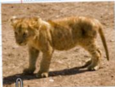
A lion cub.

The lion is an endangered species due to habitat loss and conflict with humans.